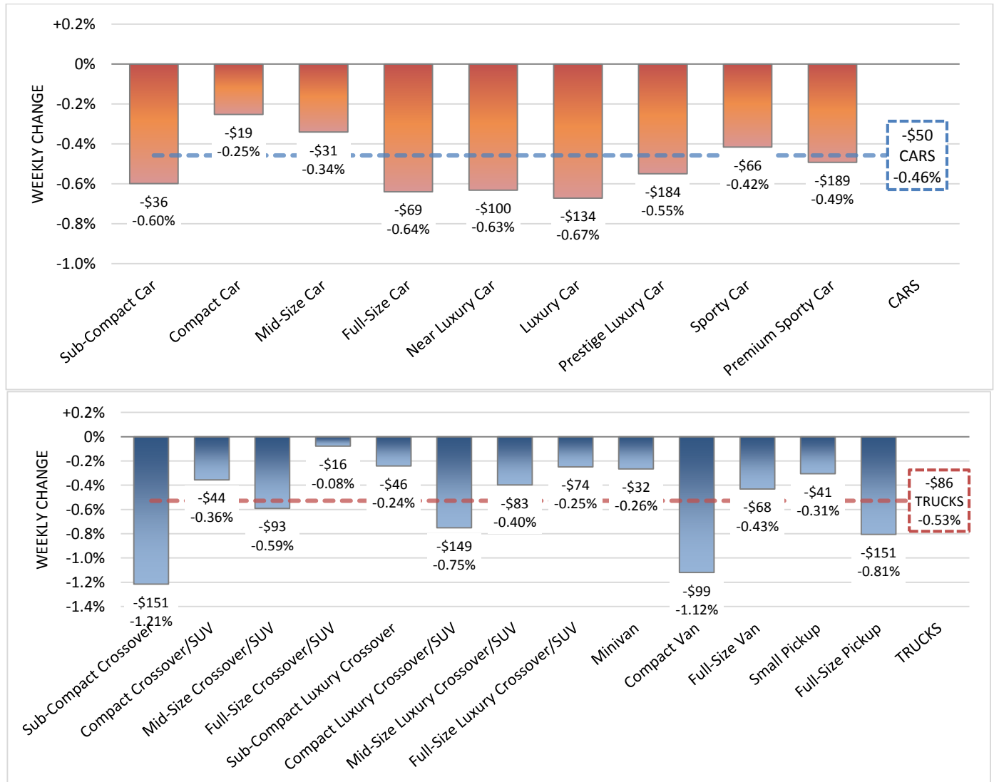
Model Years: 2008-2014, Volume Weighted Wholesale Average Values, Weekly Change from 9/9/16 to 9/16/16